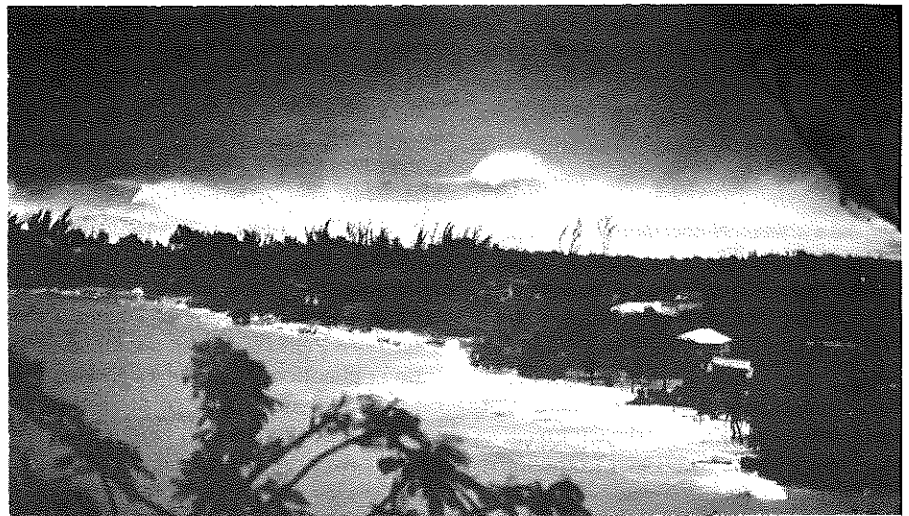
Fig. 2. Waves of Hurricane Allen breaking on East Fore Reef at Discovery Bay (Fig. 1, location E) at 0700, 6 August 1980. Wave heights were calculated to be 12 m; trees on shoreline are 15 m high.

Differences in damage to different growth forms (7) were particularly striking for corals, whose skeletal morphologies include branching, foliaceousness, encrusting, and head forms. As reported previously (5), branching species were more susceptible to hurricane damage than were massive heads (Fig. 4B). In an extreme example, at a depth of 6 m on