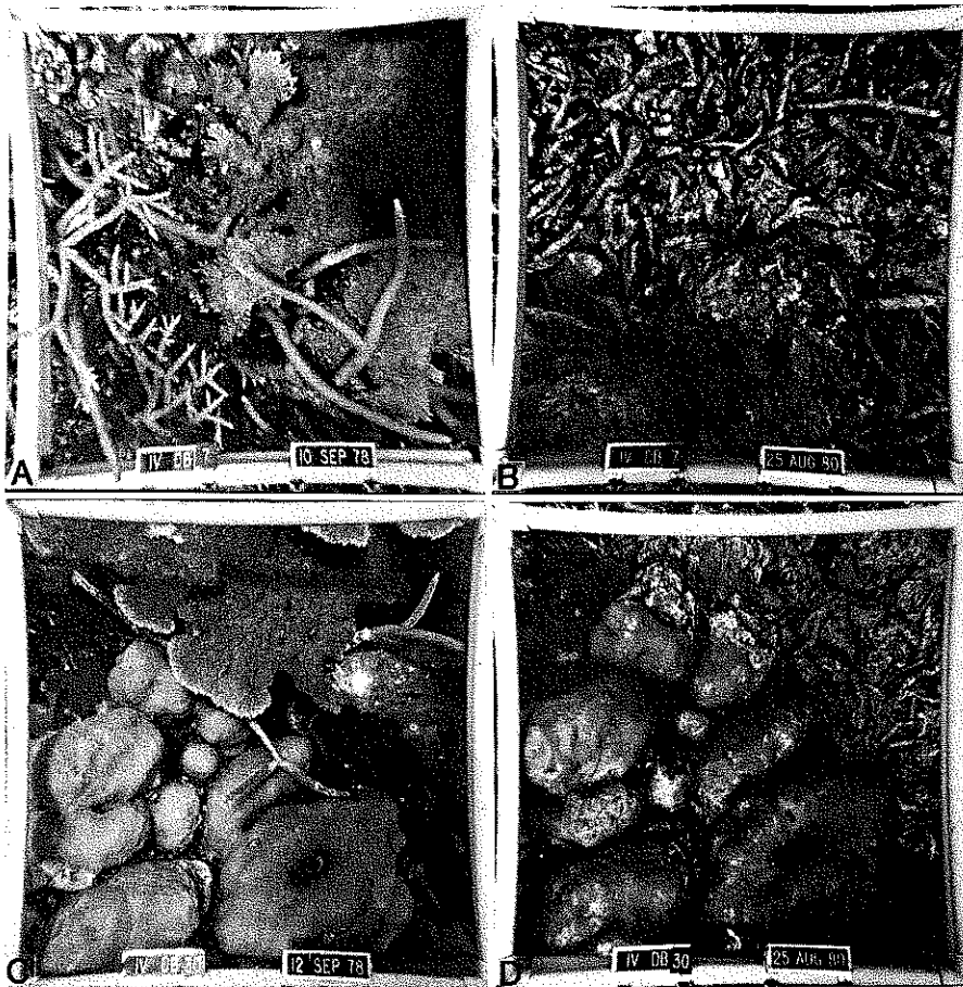
Fig. 3. Photostation on Monitor Reef (Fig. 1, location C; depth 6 m) before (September 1978) and 19 days after Hurricane Allen (each photograph 1/4 m 2 ). (A) Branching Acropora palmata (upper right), A. prolifera (lower left), and A. cervicornis (lower right) before Hurricane Allen. (B) The same quadrat after the hurricane showing total destruction of Acropora spp. (C) Acropora palmata overtopping massive Montastrea annularis before Hurricane Allen. (D) The same quadrat after the hurricane showing removal of A. palmata and lesions on M. annularis .